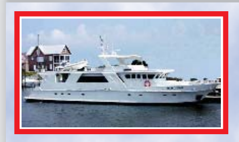
CHART A COURSE FOR SUCCESS

For Centuries the ocean has fueled our sense of adventure, and taught us valuable lessons about survival and our connection to the environment. That premise, learning about ourselves and our environment, is what Ocean Science International, Inc. is all about.