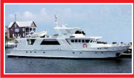
CHART A COURSE FOR SUCCESS

For Centuries the ocean has fueled our sense of adventure, and taught us valuable lessons about survival and our connection to the environment. That premise, learning about ourselves and our environment, is what Ocean Science International, Inc. is all about.